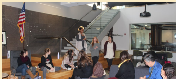
November 8th: SJSC held a moment of silence in memory of the victims of the First Baptist Church in Sutherland Springs, Texas.

"I feel that there is a collective consensus among the Core Leaders that there needs to be a space within WJC for students to actively discuss recent political and social-cultural events that are impacting our nation, communities, student body, and clients. The Coalition will not only allow students to process these events, but also to feel a sense of activism and connectedness to the outside world, and be able to make change in their own capacity."