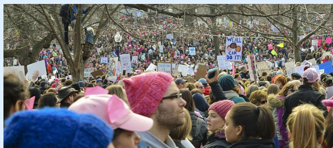
Boston Women's March, January 21, 2017

Susan B. Anthony, Sojourner Truth, Lucy Stone, Lucretia Mott, Elizabeth Cady Stanton, Harriet Tubman, and Alice Paul. Understanding the true history of our country will help us to comprehend the need for full equality under the law for all our people." (9)